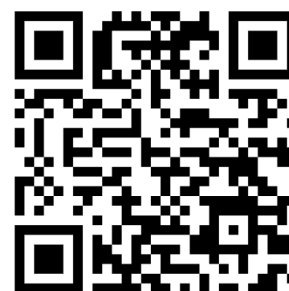
Year 3 created their own song about conserving water.. Scan the QR Code to listen!!