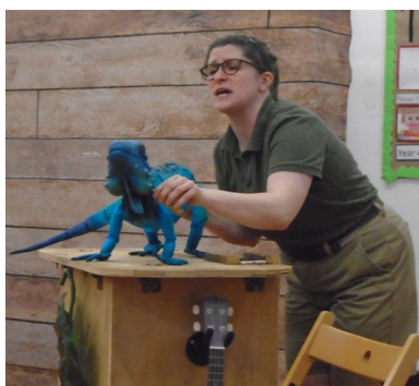
The zoo that comes to you— theatre production on Wednesday