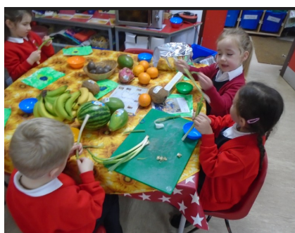
Reception enjoying breakfast from around the world.

We have learnt about concepts such as "rich" and "poor", the origins of food, how we can make a difference. We have compared and contrasted our lives with others in other countries and developed feelings of responsibility towards our world. Today we invited MP Sir Roger Gale into school to showcase our learning. Please ask the children what they have learnt this week, they have all been inspired and captivated by the topic.